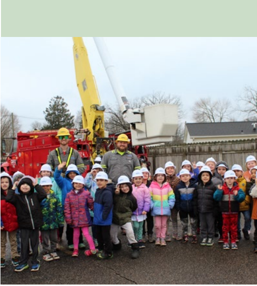
Coldwater Board of Public Utilities, as part of their Project Engage, participated in community events to rebrand their marketing department.

This award recognizes utilities for their promotional efforts in marketing, consumer awareness and branding.