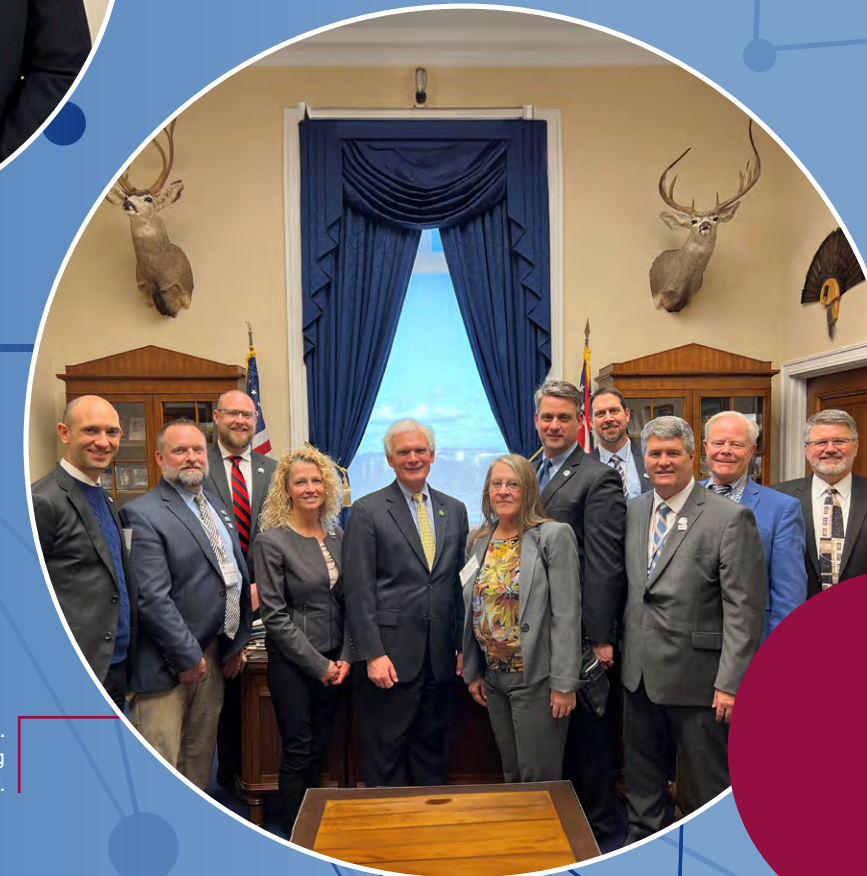
OMEA Member officials met with U.S. Rep. Bob Latta (R-5), center, during the 2023 APPA Legislative Rally.