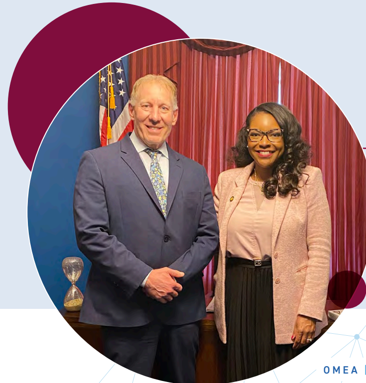
Cuyahoga Falls Mayor Don Walters met with U.S. Rep. Emilia Sykes (D-13) during the 2023 APPA Legislative Rally.

Additionally, the OMEA continues working with Sen. Brown, who has drafted legislation to mitigate the sequestration issue. While the federal legislative landscape remains unsteady, the OMEA will continue to give voice to its Members and work with legislators to safeguard against legislation that could be detrimental to Ohio's public power communities.