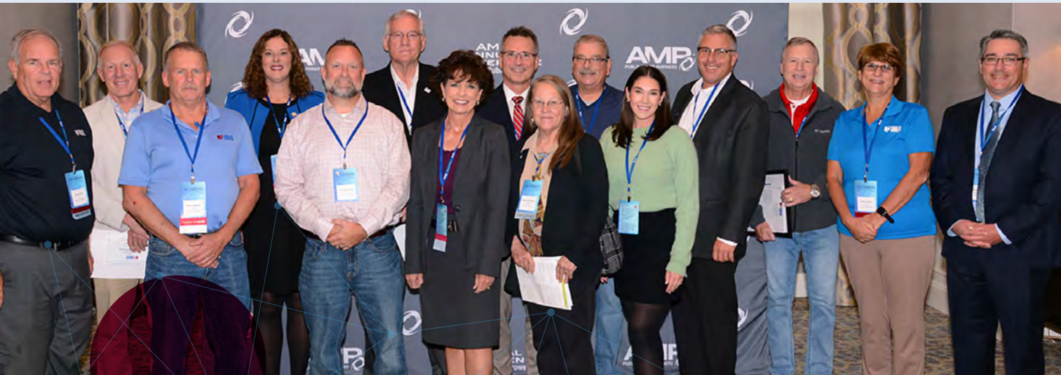
Members of the 2023 and 2024 OMEA Board of Directors

The OMEA General Membership selects Honorary Members in recognition of individuals whose dedication and service on behalf of public power has been of the highest order.