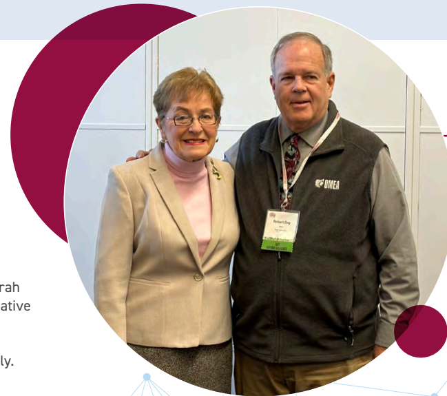
U.S. Rep. Marcy Kaptur (D-9) met with Edgerton Mayor Robert Day during the 2023 APPA Legislative Rally.